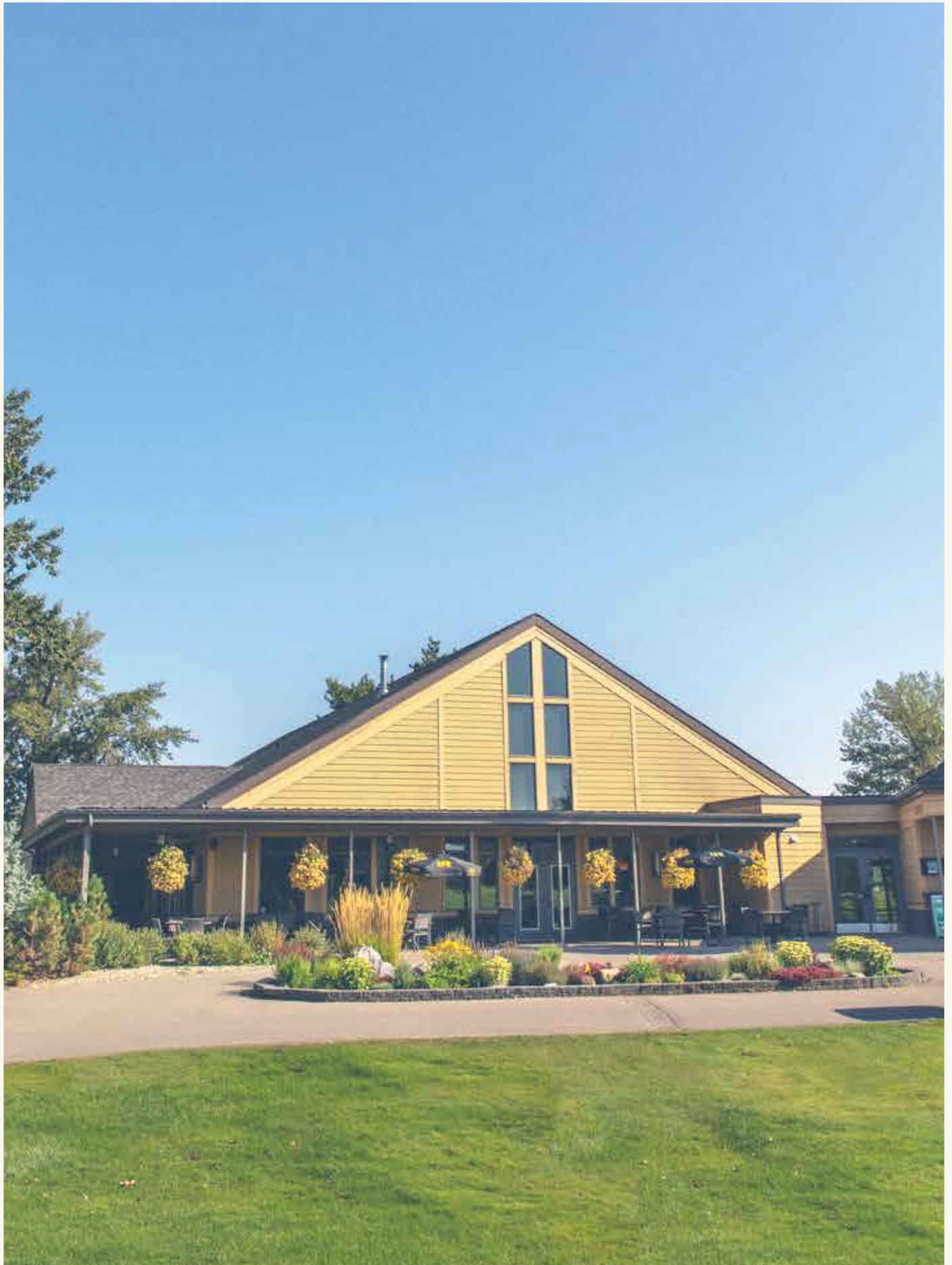
THE FOXES DEN PATIO, OVERLOOKING THE PRACTICE GREEN